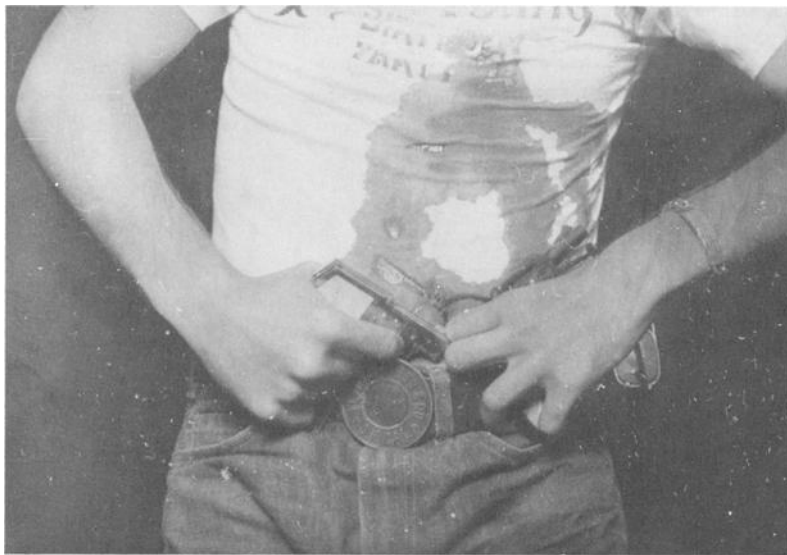
FIG. 1— Photograph showing a gun gripped by each hand.

The gunshot wound in the right temporal area was a contact wound measuring 15.9 by 11.1 mm (5/8 by 7/16 in.). Small lacerations were present in the margins and there was obvious blackening of the skin around the wound. The bullet traveled to the left and slightly backwards. It perforated the cerebral hemispheres, and the slightly deformed bullet was found lodged in the cortex in the left occipitoparietal area.